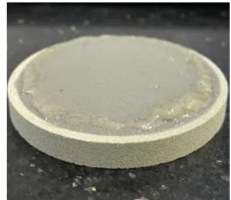
Figure 2: Fluid formulation and results on the left; PPT filtercake on the right.